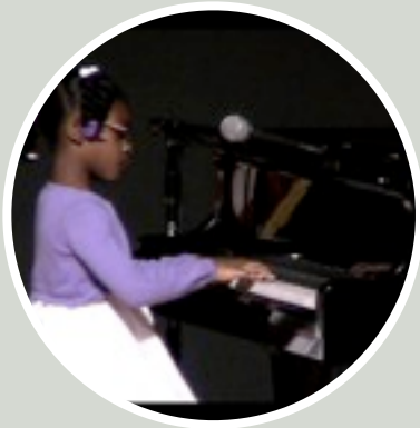
Click here to watch Student solo.