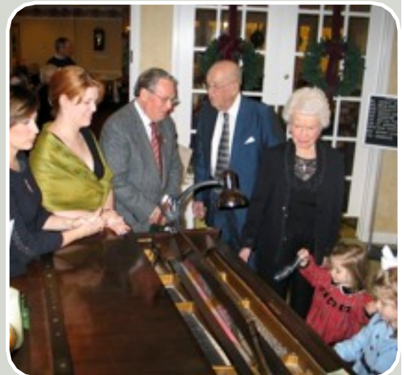
3 generations are being blessed by the power of music.

In each edition you can expect news and reviews from what is happening in various facets of PPI. Also, expect an article about the power and benefits of music for you, your children and/or grandchildren as well as exciting testimonies from time to time about those whose lives are being changed through the power of music. And we will offer you ideas and products that will enhance your family with